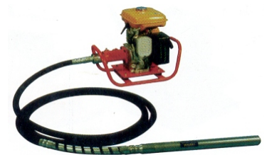
FLEXIBLE CONCRETE VIBRATOR

***Product's specification may subject to change without further notice. ***Actual product may slightly differ from pictures shown.