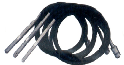
FLEXIBLE CONCRETE VIBRATOR