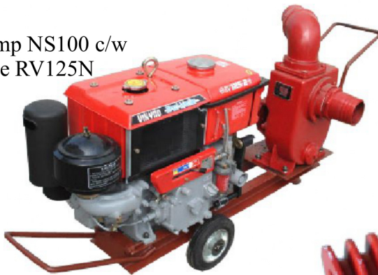
Self Priming Pump NS100 c/w Diesel Engine RV125N