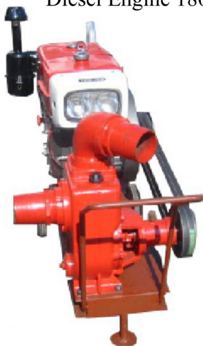
Self Priming Pump NS100 c/w Diesel Engine 180N

Stock Code : 881206001 - NS150 881206014 - NS50(Mech Seal) 881206015 - NS80(Mech Seal) 881206016 - NS100(Mech Seal)