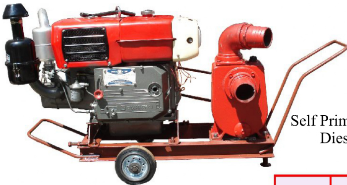
Self Priming Pump NS100 c/w Diesel Engine S195N